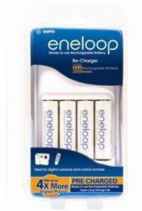
Product Packaging Shot