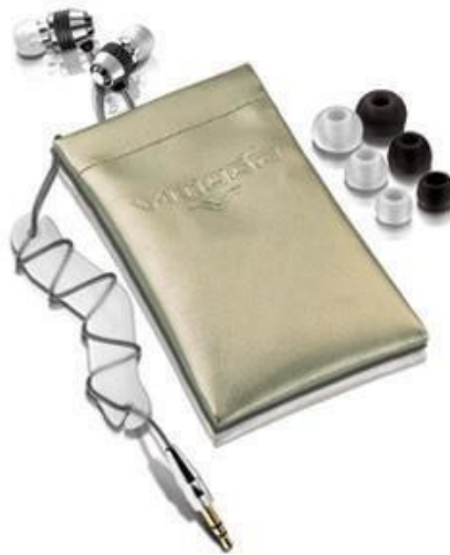
Out of Box Accessories Shot