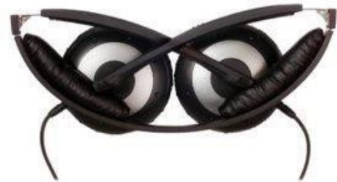
Folded / Transformed Shot (if applicable)