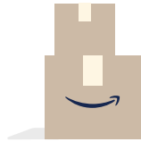
Recycled cardboard box