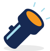
Flashlight or LED candle