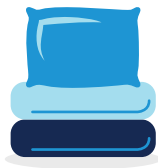
Blankets & pillows