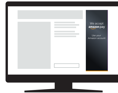
270 x 760

The banners below are examples of the best copy to use to announce the availability of Amazon Pay. Please feel free to change the image on the banners to fit with your website aesthetic, all we ask is for the Amazon Pay acceptance mark to appear in the banner. If you do create your own banners, please contact your Amazon Payments account manager before they go live.