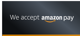
180 x 90