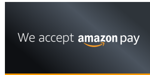
200 x 90