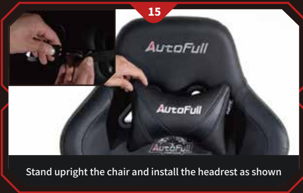
Stand upright the chair and install the headrest as shown