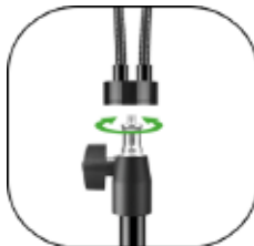
Step Two Anticlockwise Rotation