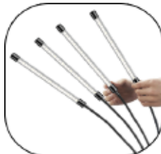
Step Four Adjust Light Tubes