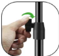
Step Three Adjust Stand Height