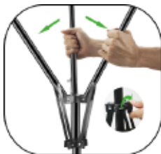
Step One Open the Tripod Stand