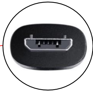
Micro USB Port