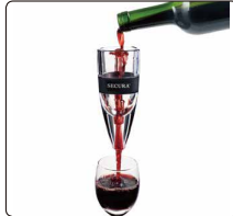
Secura Premium Wine Aerator