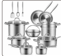
Duxtop Whole-Clad Tri-Ply Premium Cookware