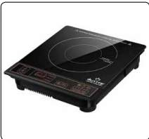
Duxtop Portable 1800W Induction Cooktop