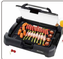
Secura 1700W Electric 2-in-1 Grill Griddle