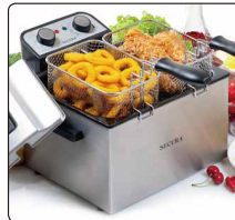
Secura Triple Basket Electric Deep Fryer