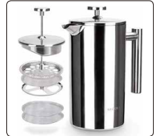
Secura French Press Coffee Maker