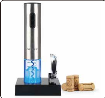
Secura Electric Wine Opener