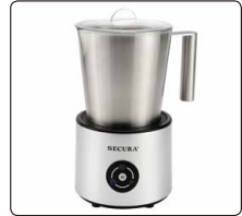
Secura Automatic Milk Frother