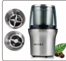
Secura Electric Coffee and Spice Grinder