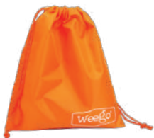
Drawstring Carry Bag