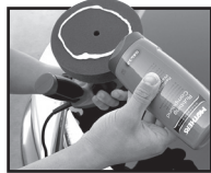
DISPENSE COMPOUND ONTO BUFFING PAD

Dispense a circle pattern of Professional Rubbing Compound onto a clean buffing pad.