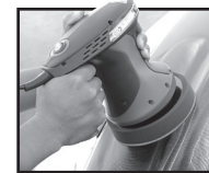
USE LIGHT PRESSURE, LET THE MACHINE DO THE WORK

Using light pressure, work an area approximately 2-3 square feet, once again overlapping the path by 50%, in at least three directions.