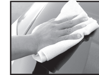
REMOVE HAZE WITH CLEAN, DRY TOWEL

Dispense a circle pattern of Mothers® California Gold® Synthetic Wax onto a clean buffing pad.