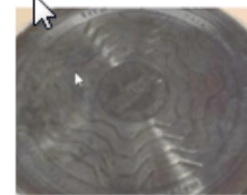
Discolouration of the external base