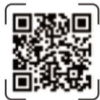
Govee Home App

For FAQs and more information, please visit: www.govee.com