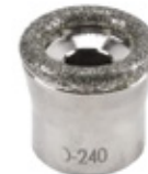
Micro beauty head