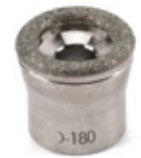
Micro beauty head