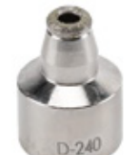
Micro beauty head