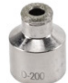
Micro beauty head