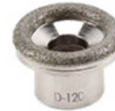
Micro beauty head

Depending on Your Skin's Thickness, Choose the Appropriate Diamond Tips.