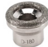
Micro beauty head