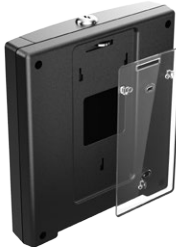
Back View with Mounting Bracket