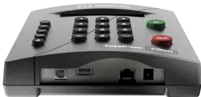
TotalPass P600 Time Clock