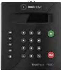
TotalPass P600 Time Clock

Below are the contents included with your TotalPass P600 time clock. If anything is missing, please contact our support line for a replacement: 1-800-847-2232.