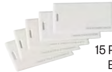
15 Proximity Badges