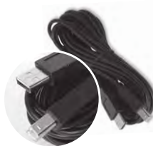
15' USB Cable