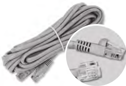
15' Ethernet Cable