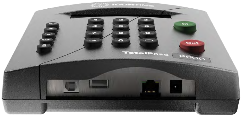
TotalPass P600 Time Clock

The TotalPass P600 time clock includes three connection options: Wi-Fi, Ethernet, or USB.