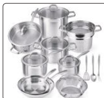
Duxtop Professional Stainless Steel Cookware