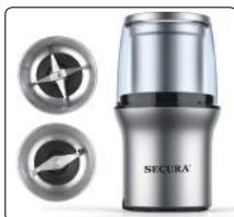
Secura Electric Coffee and Spice Grinder