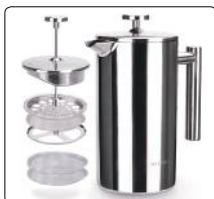
Secura French Press Coffee Maker