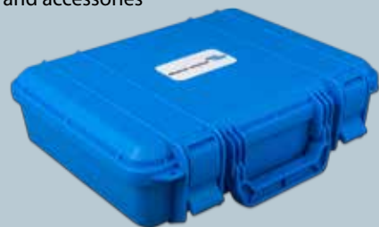
Carry Case for Blue Smart IP65 Chargers and accessories