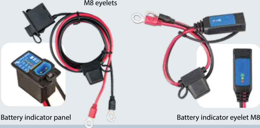
Battery indicator panel