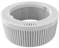
Calcium sulfite filter