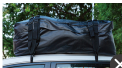
One strap is tighter than the other