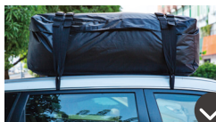
Straps tied tightly