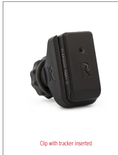
Clip with tracker inserted