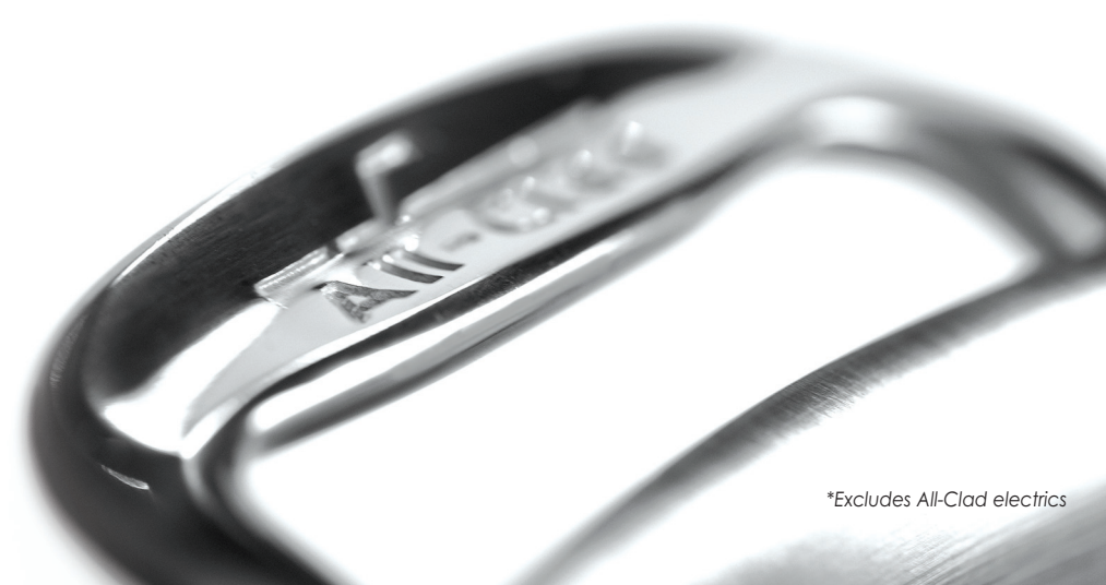
*Excludes All-Clad electrics

Handcrafted by artisans in the heart of American steel country, our roots in metallurgy led to the world's first bonded cookware and secured All-Clad's place as the choice of professional chefs and passionate home cooks. Designed to deliver consistently exceptional culinary results, All-Clad's unparalleled level of durable craftsmanship and performance is guaranteed to last a lifetime.