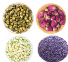
4* Dried flowers (lavender, jasmine, rose, chrysanthemum)