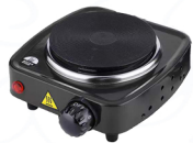
1*Black electric stove