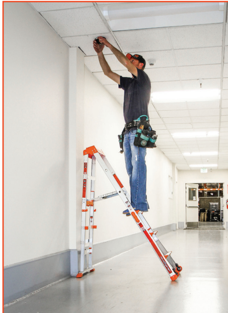
Use the 90° position for walls and tight corners.