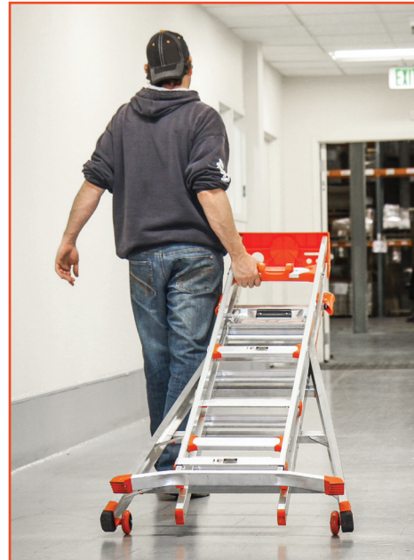
Wheel it easily from place to place.