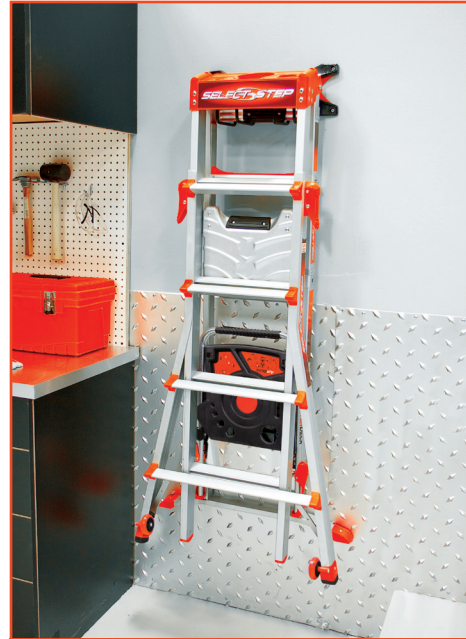
Lightweight, compact, and easy to store.