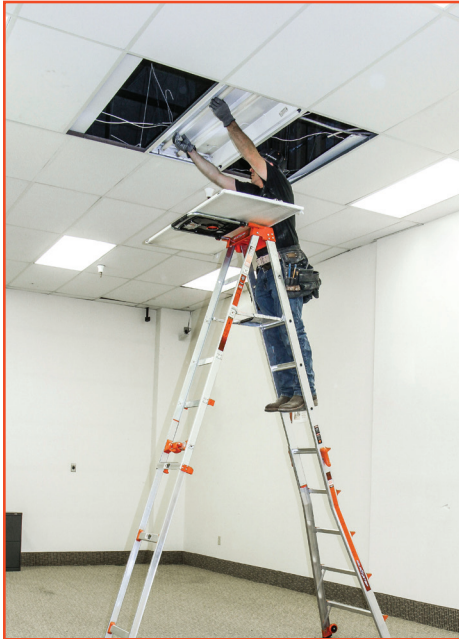
Large convenient AirDeck for tools and materials