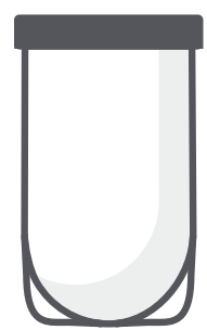
tall cup with lip ring