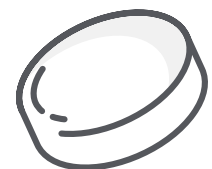
stay-fresh resealable lid