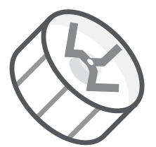
stainless steel cross blade