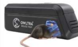
Model : EMZ30 Size : 185 x 65 x 65 mm (7.28*2.56*2.56in L*W*H)