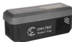
Model : ERZ-50 Size : 287*104*117 mm (11.3*4.09*4.6 in L*W*H)