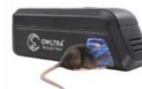
Model: EMZ30 Size: 185 x 65 x 65 mm ( 7.28*2.56*2.56in L*W*H)