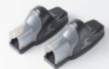
Model : TST-217 Size : 155 x 59 x 73 mm (6.1*2.32*2.87in L*W*H)