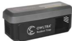
Model: ERZ-50 Size: 287*104*117 mm (11.3*4.09*4.6 in L*W*H)