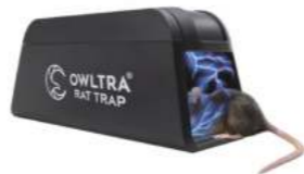
Model: ERZ20 Size: 246 x 87 x 103 mm ( 9.69*3.43*4.05in L*W*H)