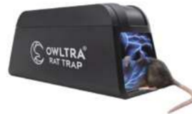
Model : ERZ20 Size : 246 x 87 x 103 mm (9.69*3.43*4.05in L*W*H)