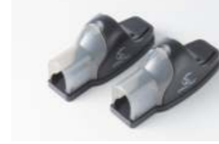
Model: TST-217 Size: 155 x 59 x 73 mm ( 6.1*2.32*2.87in L*W*H)