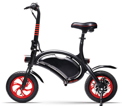
BOLT ELECTRIC FOLDING SCOOTER