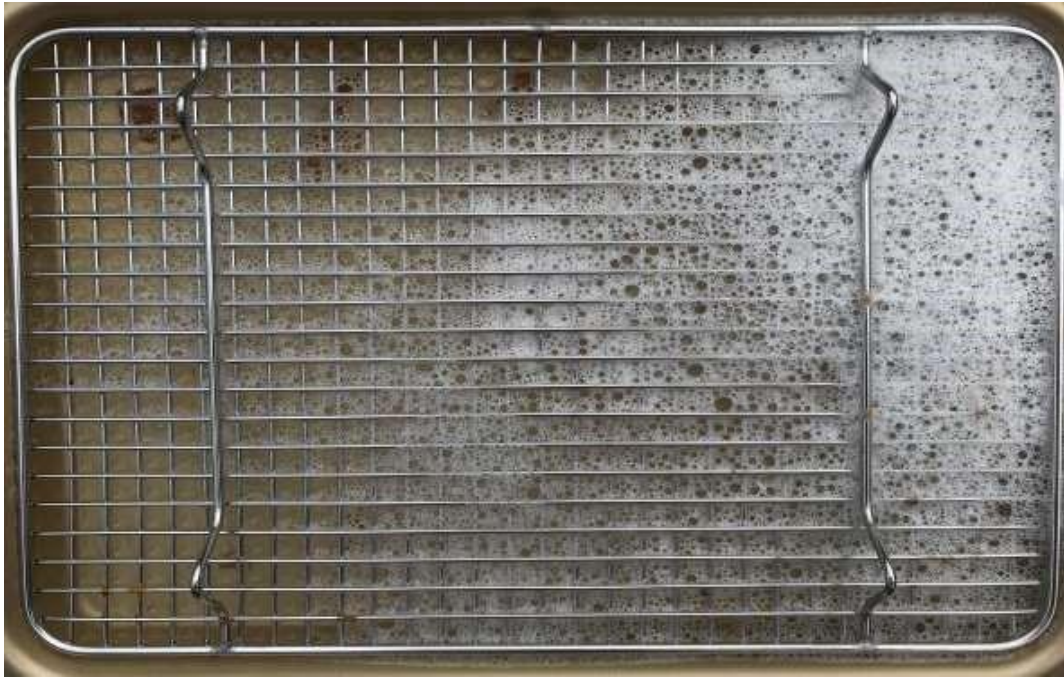
(An 8.5"x12" cooling rack after baking chicken in the oven)

For tough stains and food particles, fill the sheet pan or kitchen sink with hot water. Add ½ cup of powdered or liquid dish detergent and baking soda. Add lemon juice for scent.