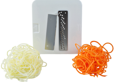
Shredding Blade 3x3 mm