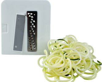
Chipping Blade 4x6 mm