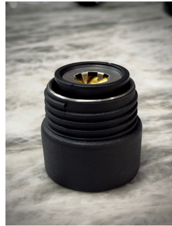
② Then press to puncture it