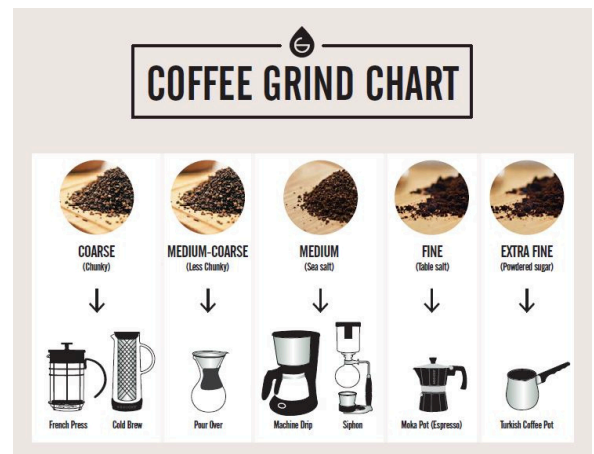
Choose the right grinder scale