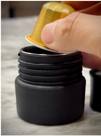
① Put the coffee capsule in it