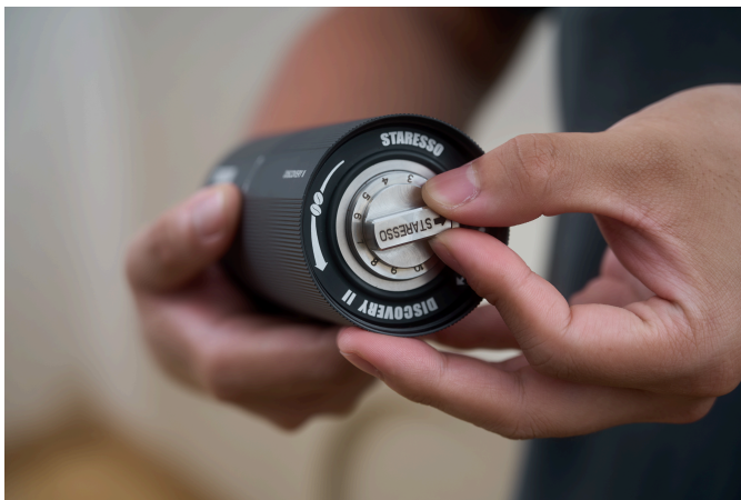
Adjust the coffee bean grinder

Choose the appropriate grind size for your coffee beans. If you've never made espresso before, we recommend that your coffee grounds resemble table salt . If your coffee grounds look like flour or wood shavings, you're using an incorrect size, which can result in improper espresso extraction. Here, you can refer to my coffee ground standard;)